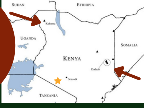
Kakuma and Dadaab camps are each more than 300 miles from the capital city, Nairobi.

In Kenya, refugees are required to live in refugee camps. Our students live in two camps: Kakuma and Dadaab camps